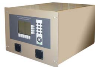
Electronical Compensated Current Burden ESCB200

The ESCB/ESVB is characterised particularly by the user-friendly menu guidance using function keys and 10,4" TFT- mono chrome display.