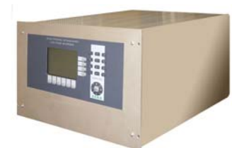
Electronical Compensated Voltage Burden ESVB200

For further information see next pages ⇒