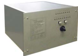
Standard Current Burden

We offer high accurate current burden with adjustable steps up to 60 VA (IEC) or 200 VA (ANSI) or voltage burden with adjustable steps up to 318.75 VA (IEC) or 400 VA (ANSI).