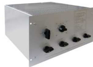
Standard Voltage Burden

For further information see next pages ⇒