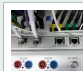
Interface for data transfer (MP2020) between Basic Meter and CR2020